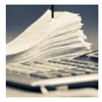
Support for issuing investment certificates, including legal documentation required by law